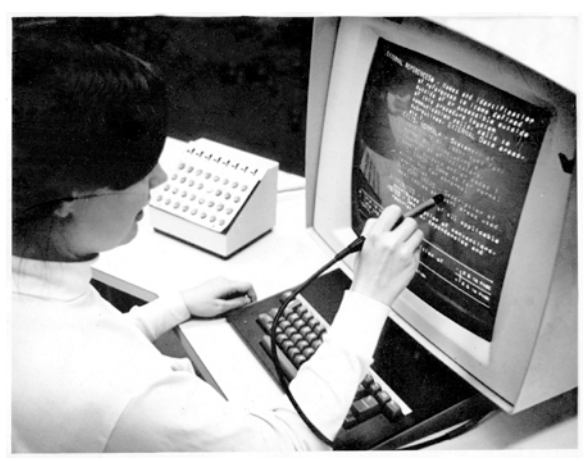
Hypertext Editing System (HES), Brown University 1968